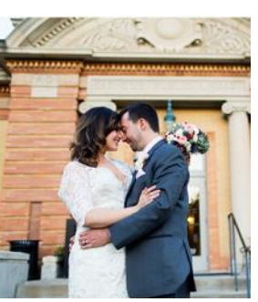
26 Weddings & Events

$63,209 in revenue for the library from 2017 weddings and future bookings