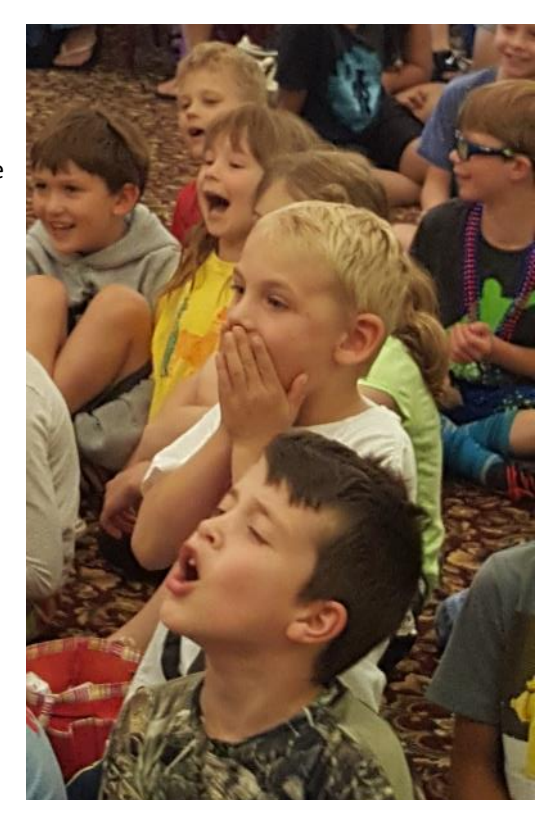
Your gifts enrich the library, strengthen the community, and transform lives.