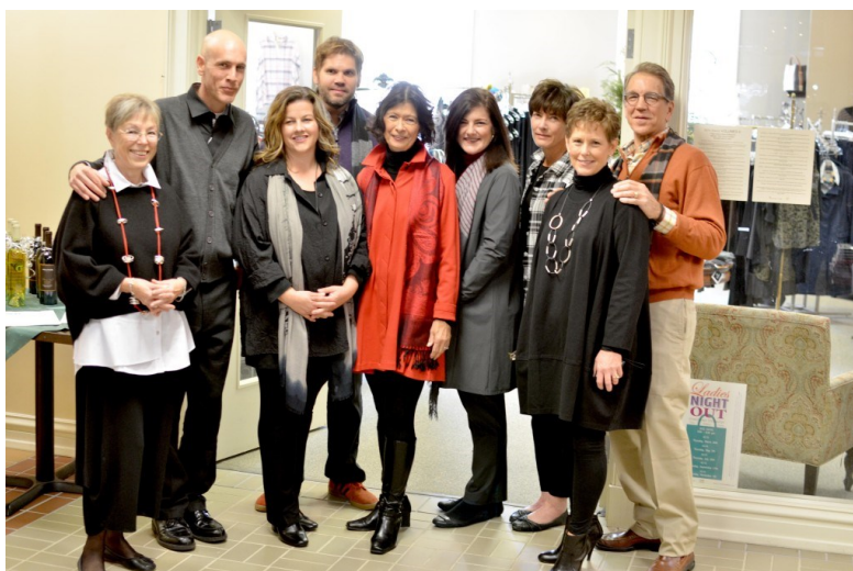
Style Speaks Volumes II authors modeling fashions from SASH and Matt+Nate:Men's.Life.Style.